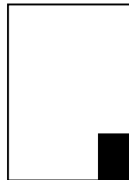
1/16 Page 1.75" x 2.5"