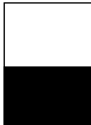
1/2 Page 7.5" x 5"