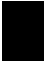
1 Page 7.5" x 10"