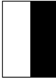
1/2 Page 3.75" x 10"